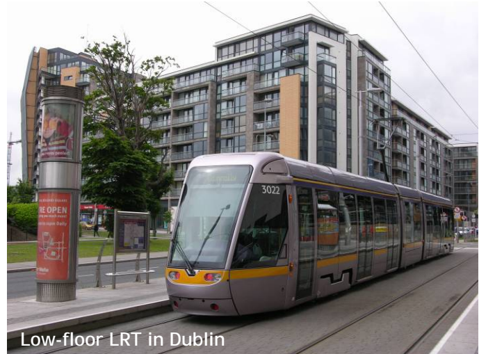
Low-floor LRT in Dublin