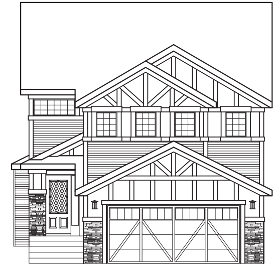
Tudor Elevation w/Optional Stone

Main Floor 894 sq. ft. Upper Floor 1182 sq. ft. Total 2076 sq. ft.