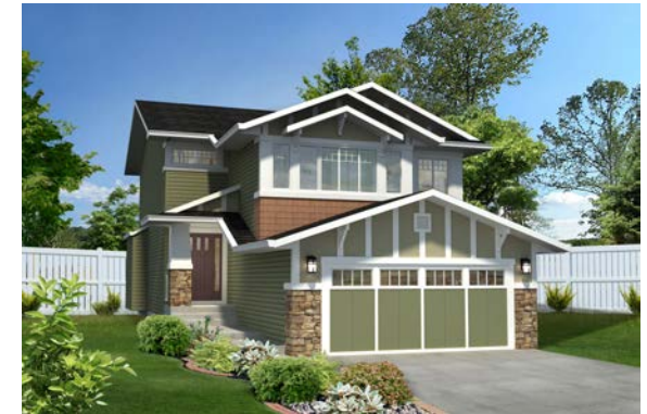
Craftsman Elevation w/Optional Stone

LINCOLNBERG MASTER BUILDER The Love Affair Lasts