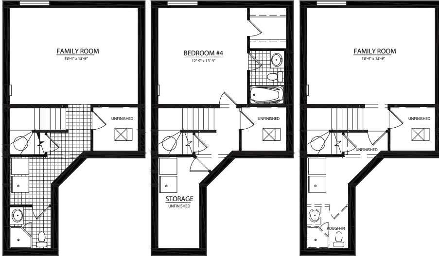
3. 336 Sq.Ft.